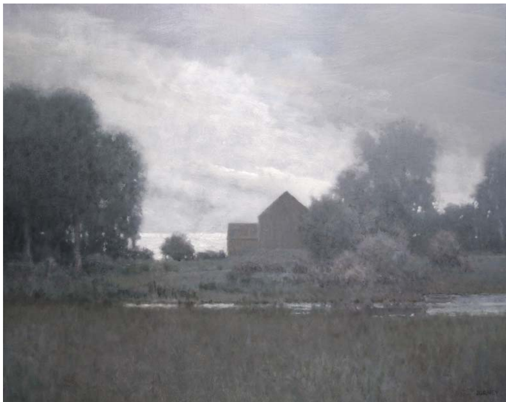
SUMMER FOG, OIL ON CANVAS, 24 X 30"