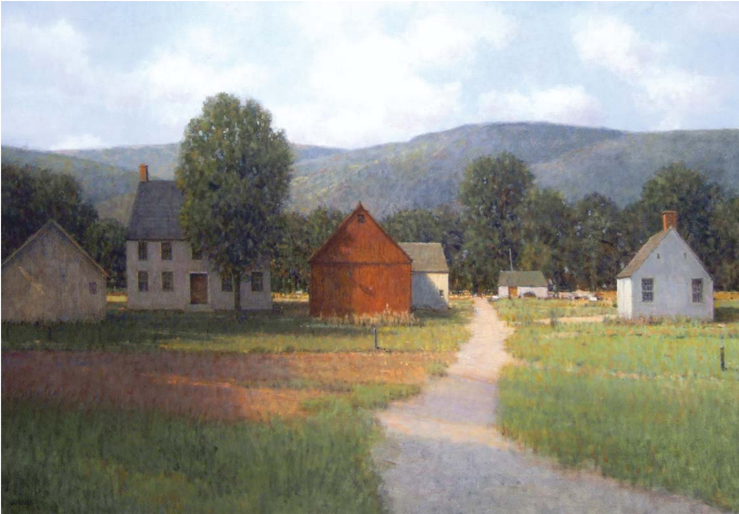
A BERKSHIRE FARM, OIL ON CANVAS, 28 X 42"