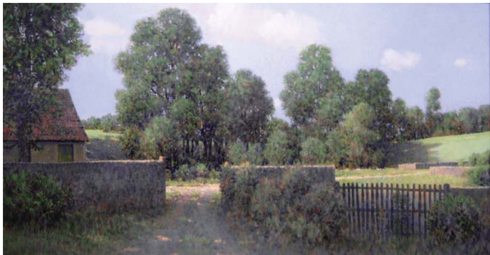
A SUMMER AFTERNOON NEAR CHAROLLES, OIL ON CANVAS, 30 X 60"