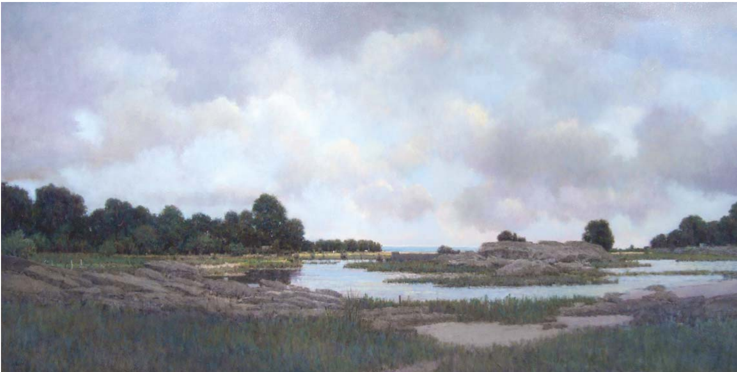
NEW ENGLAND LITTORAL, OIL ON CANVAS, 36 X 72"